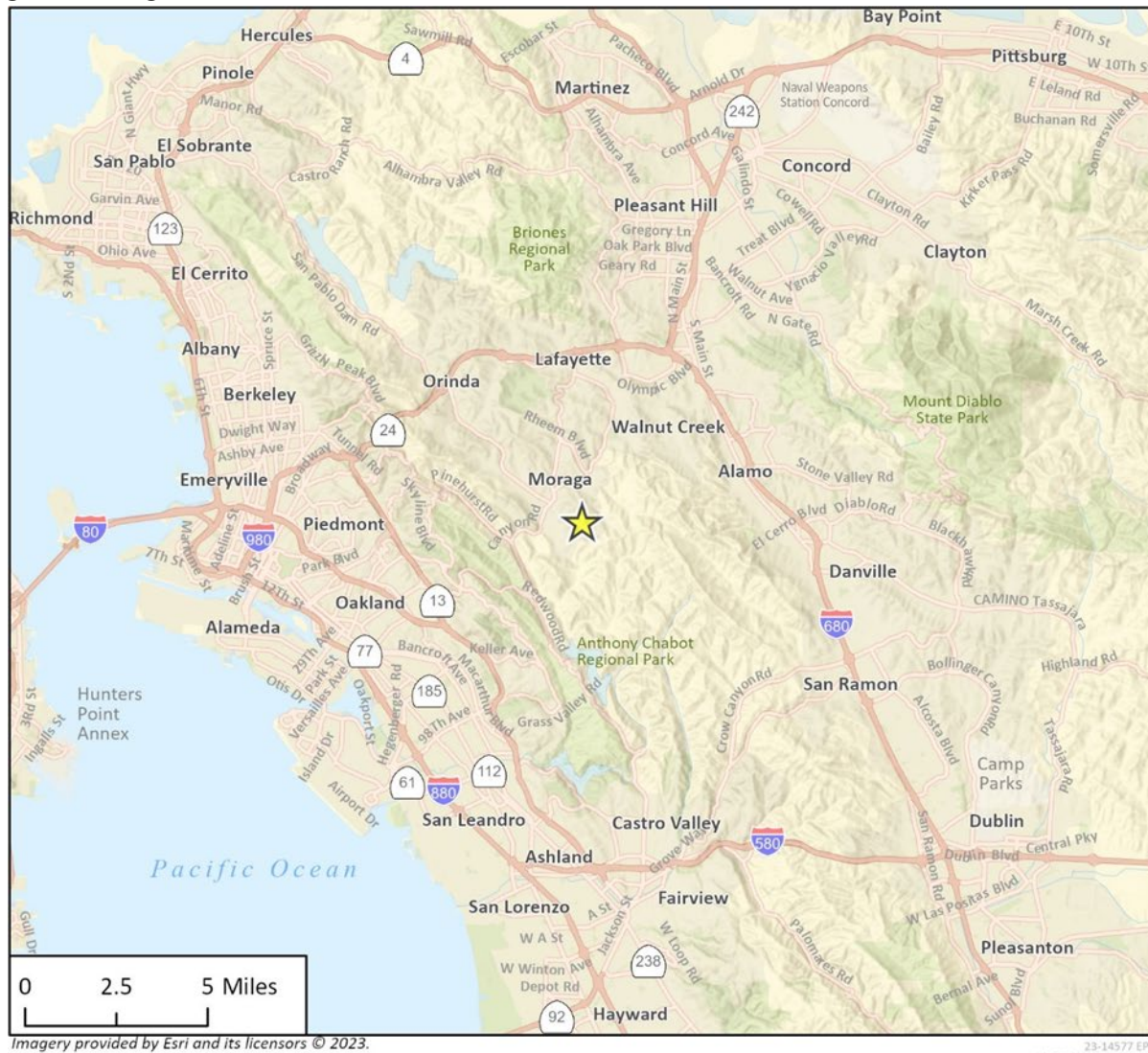
Figure 1 Regional Location