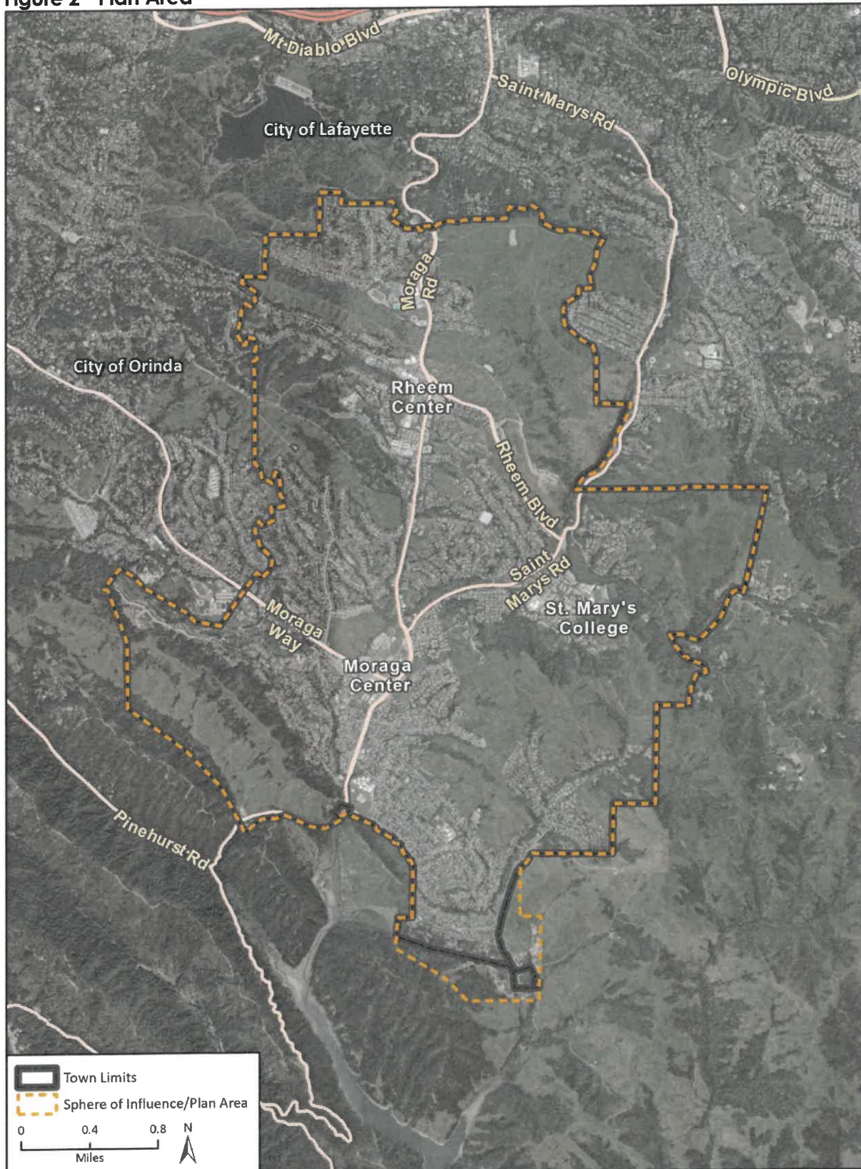
Figure 2 Plan Area