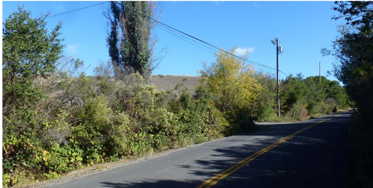
PHOTO 3. EXISTING CONDITION LOOKING EAST ALONG CANYON ROAD AND THE PROPOSED PROJECT FRONTAGE ON THE IMMEDIATE LEFT SIDE (PHOTO 3 - BEFORE DEVELOPMENT)