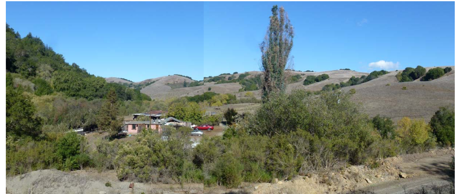
REFERENCE PHOTO 4. VIEW LOOKING NORTHEAST TOWARDS THE EXISTING CONDITION OF THE PROPERTY FROM AN ELEVATED (22') POSITION ACROSS AND ABOVE CANYON ROAD IN ORDER TO SEE INTO THE VALLEY