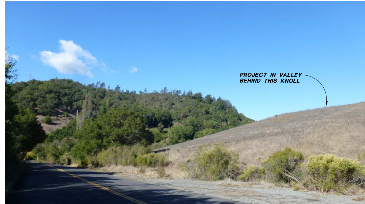
PHOTO 1. EXISTING CONDITION LOOKING WEST ALONG CANYON ROAD TOWARD THE COMMUNITY OF CANYON WITH THE PROPERTY ON THE IMMEDIATE RIGHT (PHOTO 1 - BEFORE DEVELOPMENT)