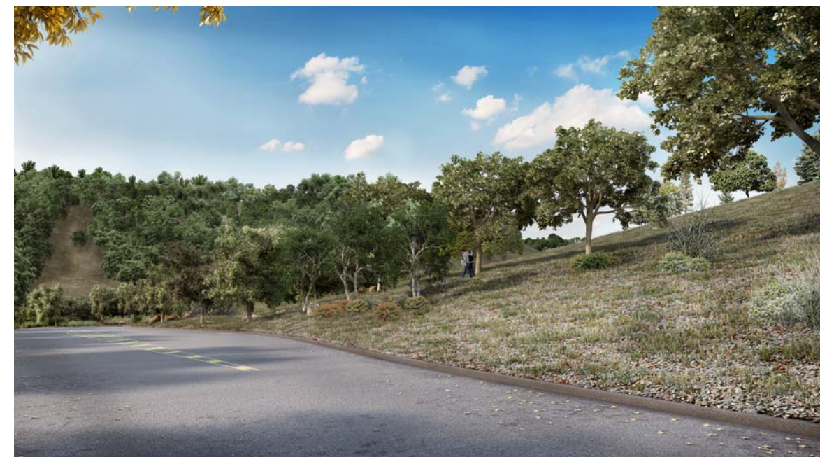
COMPUTER VISUALIZATION 1.) VIEW LOOKING WEST ALONG THE CANYON ROAD FRONTAGE OF THE PROPOSED PROJECT ON THE IMMEDIATE RIGHT WHICH IS BEHIND THE KNOLL (SIMULATION 1 - AFTER DEVELOPMENT)