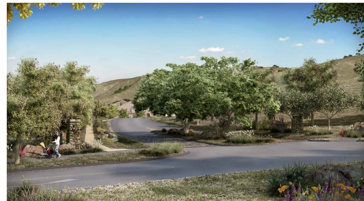
COMPUTER VISUALIZATION 2.) VIEW LOOKING NORTH FROM CANYON ROAD TOWARDS THE PROPOSED ENTRY TO THE PROJECT (SIMULATION 2 - AFTER DEVELOPMENT)