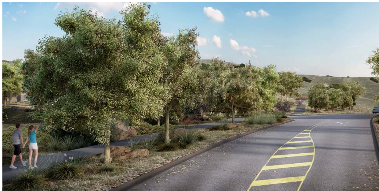
COMPUTER VISUALIZATION 3. VIEW LOOKING EAST ALONG THE CANYON ROAD FRONTAGE TOWARDS MORAGA TOWN CENTER OVER THE RIDGE WITH THE PROPOSED PROJECT ON THE IMMEDIATE LEFT (SIMULATION 3 - AFTER DEVELOPMENT)