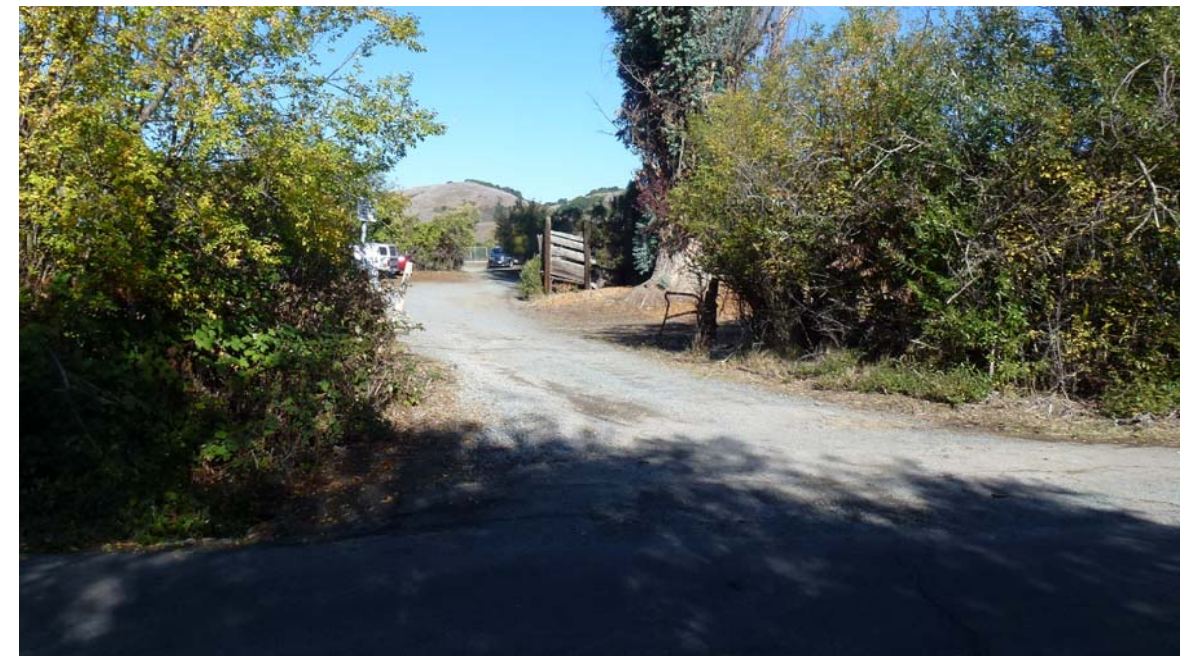
PHOTO 2.) EXISTING CONDITION LOOKING NORTH FROM CANYON ROAD INTO THE PROPERTY AT THE LOCATION OF THE PROPOSED ENTRY SHOWN BELOW (PHOTO 2 - BEFORE DEVELOPMENT)