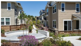
Comprehensive Advanced Planning Initiative