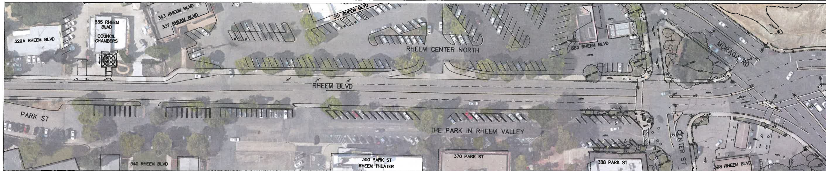
EXISTING PARKING CONDITIONS